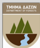
Ministry of Agriculture, Rural Development and Environment, Department of Forests, CYPRUS