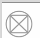
Greek Planners Association

The project is co-funded by the European Union and National Funds of the participating countries